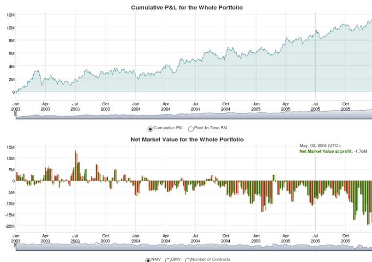
Figure 5: Plots with commodity data. The plot of P&L is at the top and the plot of market values is at the bottom. Green bars represent profit and red bars represent loss. The user can zoom in on the plots by either selecting the corresponding region with mouse or changing the time slider bar.

The plots are interactive using the dygraphs package [?]. The user can zoom in to look at any specific time period on the plots. She can either select and drag the corresponding region with mouse, or change the time slider bar beneath the plots. The user can go back to the initial scale by double clicking the plot. Color of the plots is based on the sign of point-in-time P&L. Green bars represent profit and red bars represent loss. If the cursor is hovering above a specific bar, the legends of the plot will give specific values of the date and the response variable of that bar. Note that the data is automatically rounded. For example, a P&L of “2,856,000” will be presented as “2.86M”.