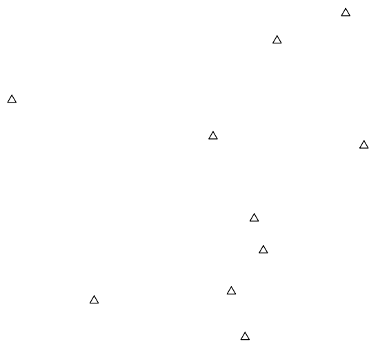
Figure 1: plot of SpatialPoints object; aspect ratio of x and y axis units is 1